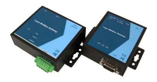
Version 1.1 Updated on Sept. 14, 2010