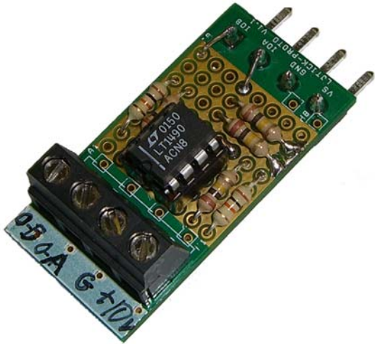
Figure 2: 2X output amplifier built on LJTick-Proto (Top)

Figure 3 also shows the various surface mount pads available on the LJTP. None of the pads are connected to anything.