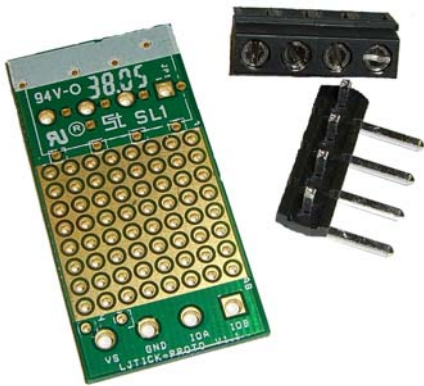
Figure 1: LJTick-Proto (LJTP)

The LJTick-Proto (LJTP) consists of an 8x8 grid of holes for prototyping custom signal-conditioning ticks. The 4-pin design plugs into the standard IO/IO/GND/VS screw terminal block found on newer LabJacks such as the U3 and UE9. Includes 3 loose pieces: the PCB, a 4-position screw terminal, and a right-angle pin header.